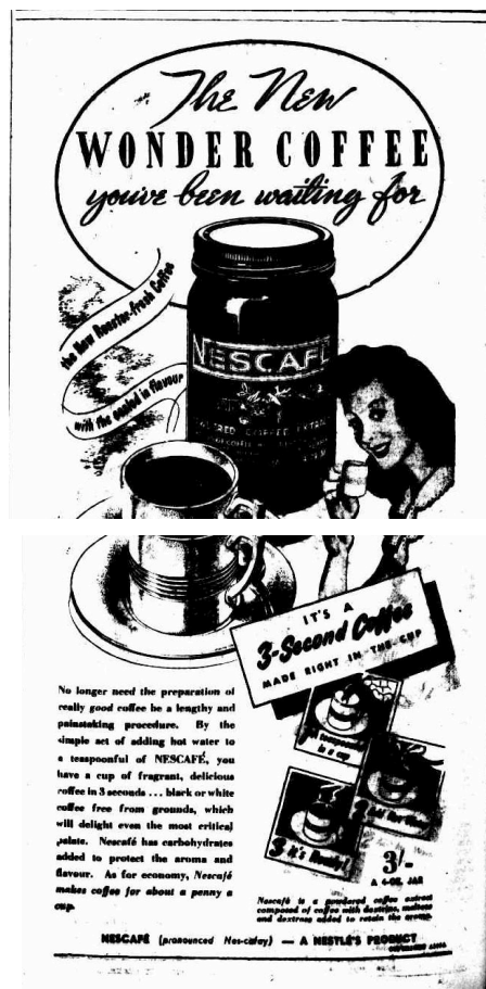
Fig. 3. Nestlé Advertisement. The Canberra Times 5 August 1949, 2 http://nla.gov.au/nla.news-article2817126

By 1952 Nestlé's Dennington plant in Victoria, was in full production with coffee now made from 100% beans and no carbohydrate. Nescafé accounted for 17% of all coffee consumed here. Instant coffee was convenient and modern. There was no mess and it made a perfect cup every time, and in just three seconds (Khamis 2009: 224-225).