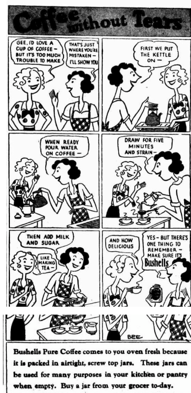
Fig. 2. Advertisement for Bushells Coffee. The Argus Thursday 19 July 1945 http://nla.gov.au/nla.news-article975544